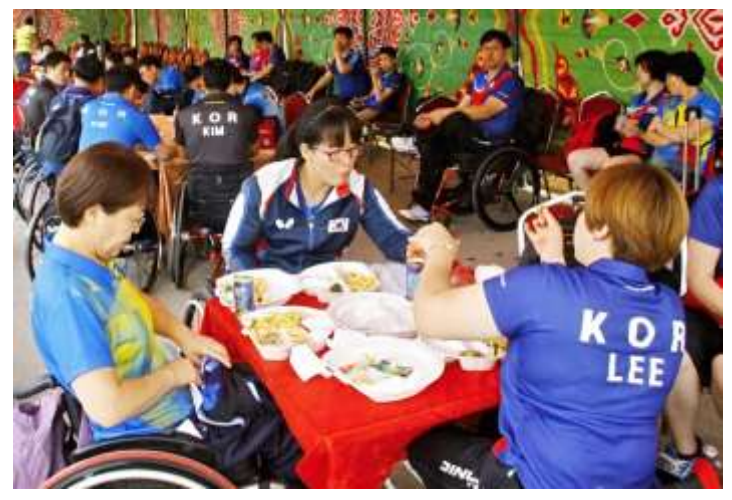
The lunches were organized in the special big tent in Venue

days and improved later. As we expected over 200 players and team officials, the restaurant is big not enough to accommodate this number, in particular that there were some 99 wheelchair players. So the Hotel agreed to open another line outside the lobby area if there were more people coming for breakfast and dinner at the same time.