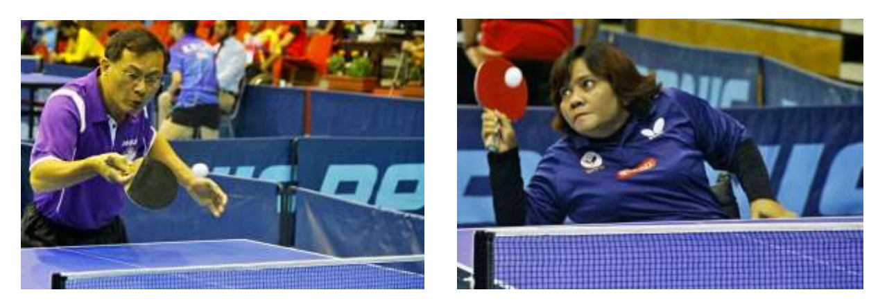
Players From Chinese Taipei and India in their Singles Events

<u>CONCLUSION</u>: We would like to thank the Local Organizing Committee, their members, volunteers, officials, ball persons and moreover all the other officials and umpires who had helped tremendously to make the Championships possible, and without much difficulties.