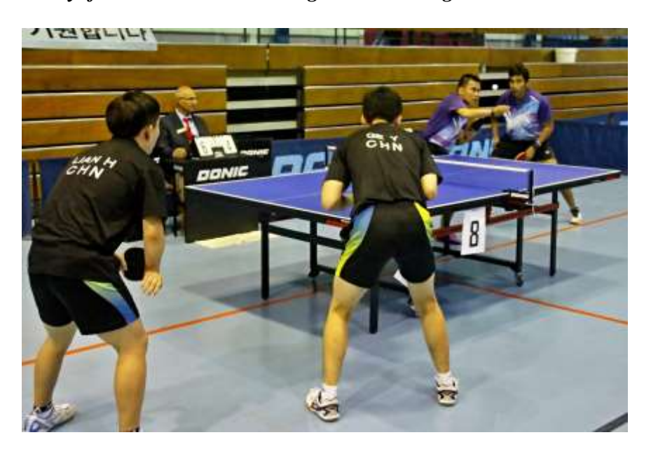
Some photos only from the matches during the Asian Regionals 2015:

11 teams out of 16 returned the questionnaire on October 27 and the general comments were not very positive, in particular the quality of breakfast and lunch. The performance of umpires varied a lot, that is, some very good and some very bad. Please refer to the Results of Questionnaire attached to this TD Evaluation Report.