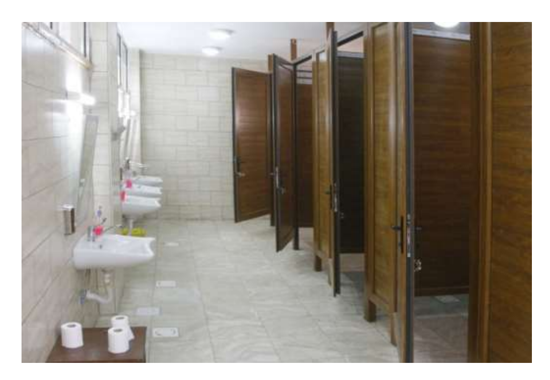
Five new toilets for the women and four toilets for the men are there.