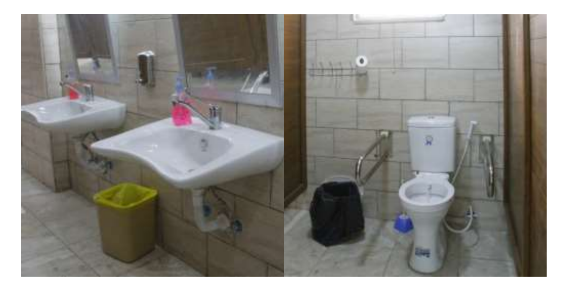
Some details from the new toilets for the wheelchairs.

Wifi : Not available to teams. Those provided to officials were always very weak and we had to spend time to seek for assistance